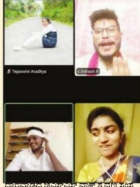
ಧಾರವಾಡದ ಜೆಎಸ್‌ಎಸ್ ವಾಕ್ ಶ್ರವಣ ಸಂಸ್ಥೆ ವತಿಯಿಂದ ಆನ್‌ಲೈನ್ ಸಾಂಸ್ಕೃತಿಕ ಸಂಜೆ ಕಾರ್ಯಕ್ರಮ ನಡೆಯಿತು.